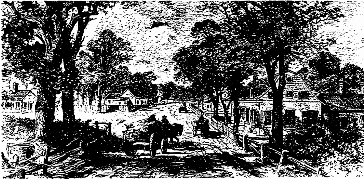
Early Brooklyn Farms